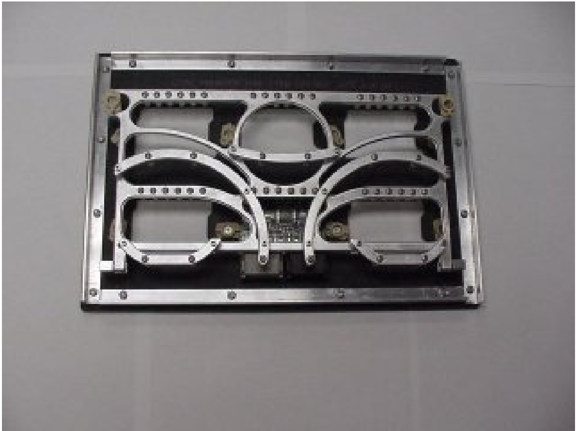
Mechanical alignment of light or unstable components during solder processing.

In many cases on complex assemblies unseated components is the #1 cause for rework. Stone Mountain Tool has the answer for that, Canopies. Our Canopies are known as the easiest to use and most durable in the market. With a variety of component hold-down designs we are sure to have the right one to suit your needs.