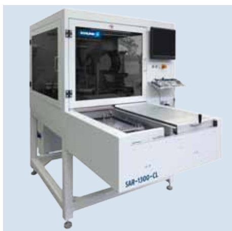
Depanelling machine SAR-1300-B 2-CL with double shuttle system and one milling bit module