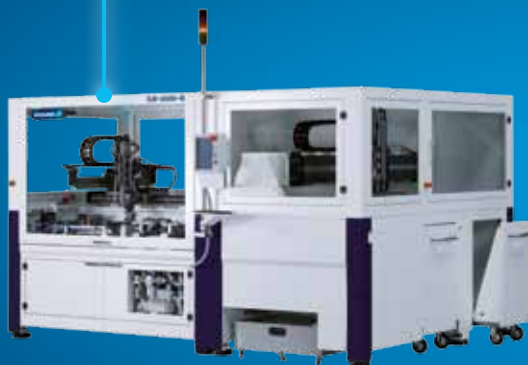
ILR-2000-B with palletizing system PAL-1400

The cost efficient routers with manual loading and unloading, developed for smaller batches and high product variance.