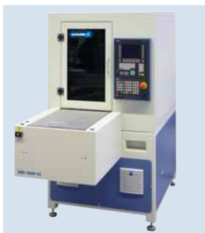
Depanelling machine SAR-1000-D 1-CL with single shuttle system and one sawing disc module