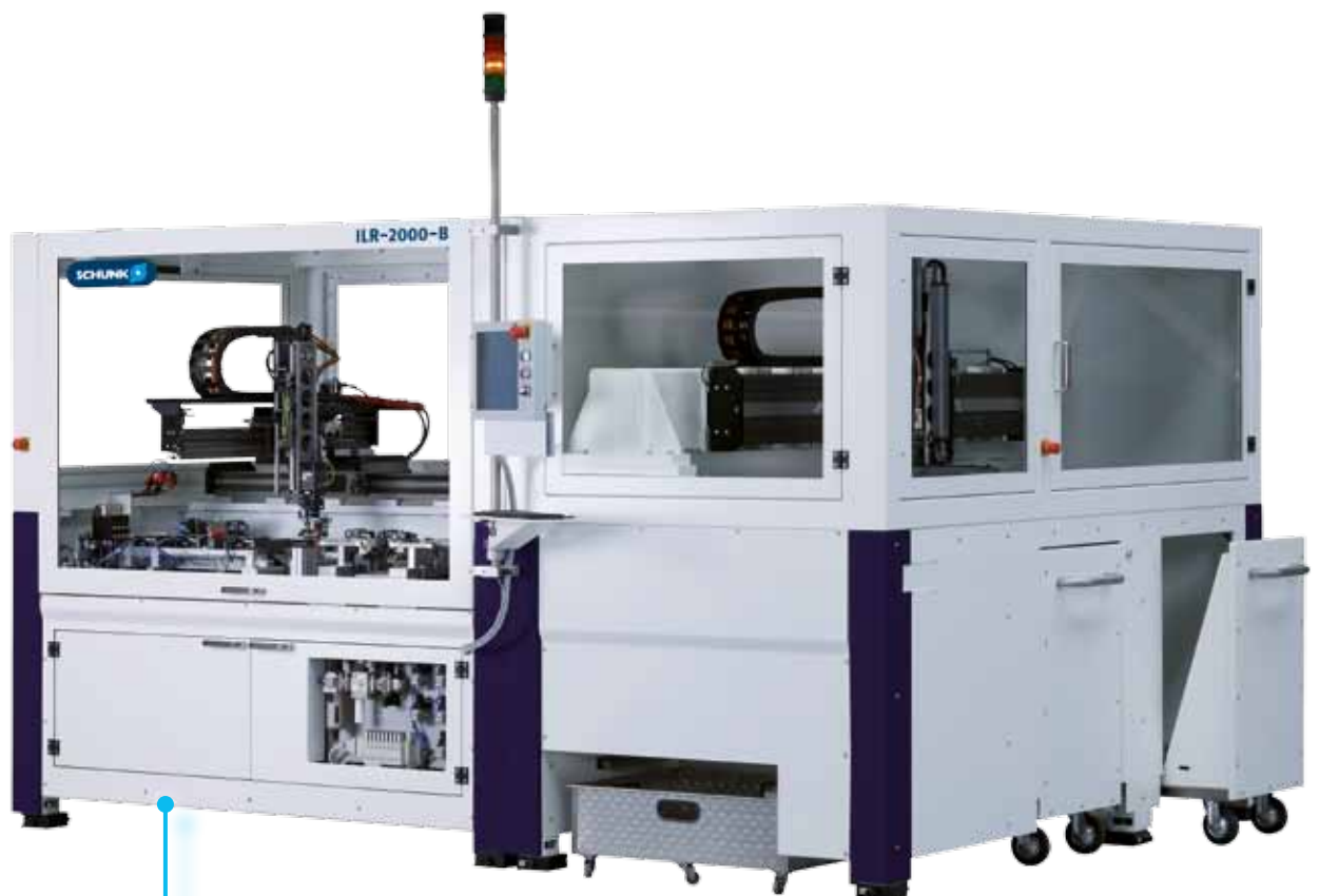
ILR-2000-B with palletizing system PAL-1400

The Inline depanelling system ILR-2000 with optional palletizing system PAL-1400 was designed specially for almost stressfree depanelling. The main focus was put on high flexibility and throughput. With the specially designed fast-acting PCB feeder and the use of highly dynamic actuators with continuous path control for detachment and handling of PCBs, the highest possible throughput is achieved. The simple and light-weight design of the PCB grippers minimizes tool costs and together with a gripper change system guarantees highest flexibility and minimum set-up time.